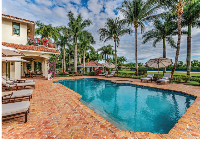
SADDLE TRAIL | $12,900,000

Footings | 6 Large Paddocks | PBIEC Access | Nelson Automatic Waterers | Amberway Fans | Expansive Tack Room | 2 Feed Rooms | Oversized Laundry Kitchen