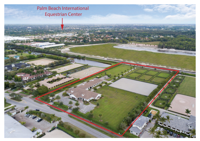
GRAND PRIX VILLAGE SOUTH | $10,995,000

Footings | 6 Large Paddocks | PBIEC Access | Nelson Automatic Waterers | Amberway Fans | Expansive Tack Room | 2 Feed Rooms | Oversized Laundry Kitchen