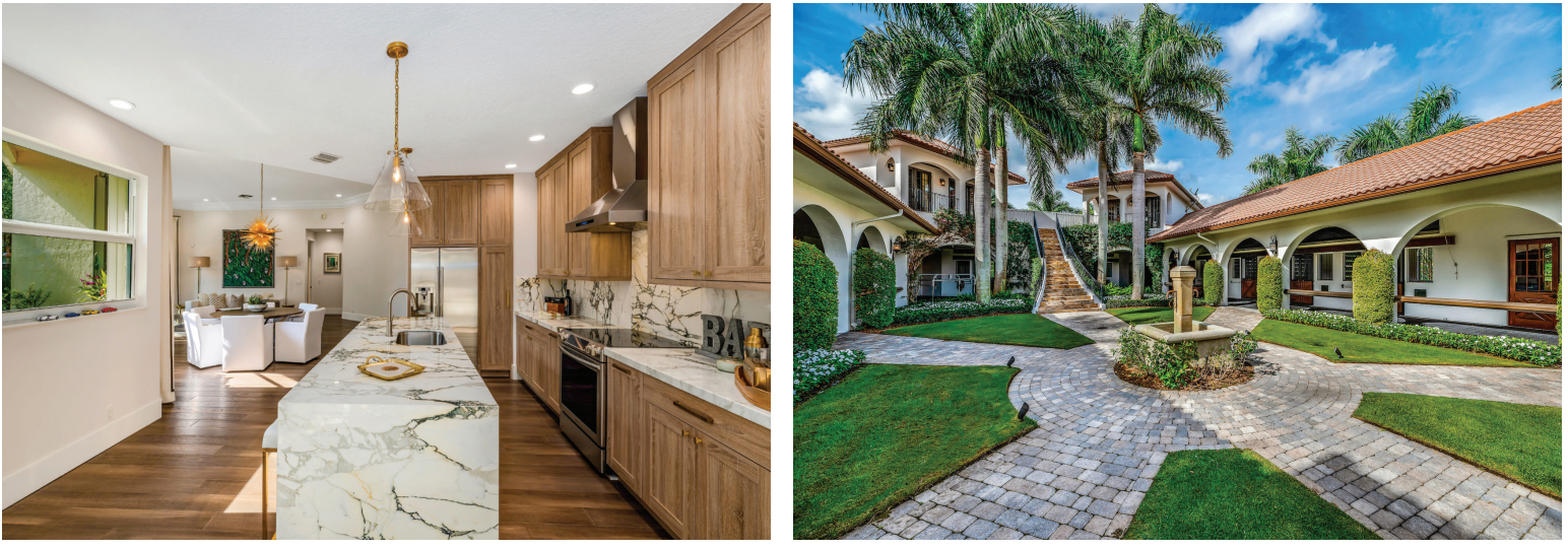
PALM BEACH POLO | EAGLES LANDING | $749,000

One-of-a-Kind Primark Partners. Affiniti Architects. Decorators Unlimited and RWB Construction Collaboration | Construction Completed May 2019 | 11,654 Square Feet with 5 Bedrooms | 114 Feet of Water Frontage | Rare Marbles Barn | 2 Studio Apartments | Managers' Apartment | Riders' Lounge | Outdoor Imported from the Hills of Italy | Gorgeous Walnut Cabinetry Sourced from Canada | Custom Furniture with an Exclusive Touch